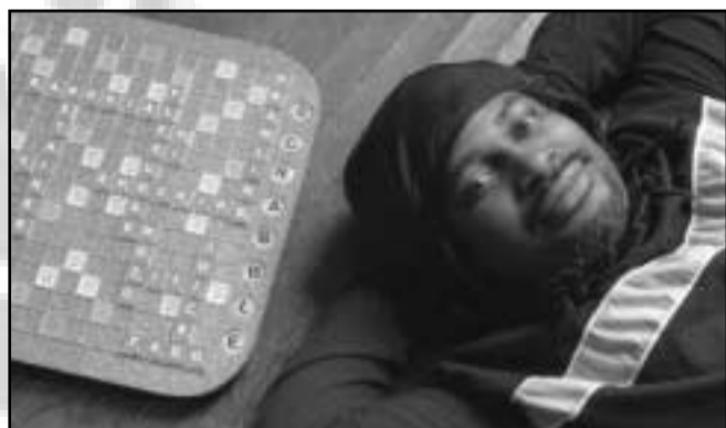
WORD WARS – Starts July 9th