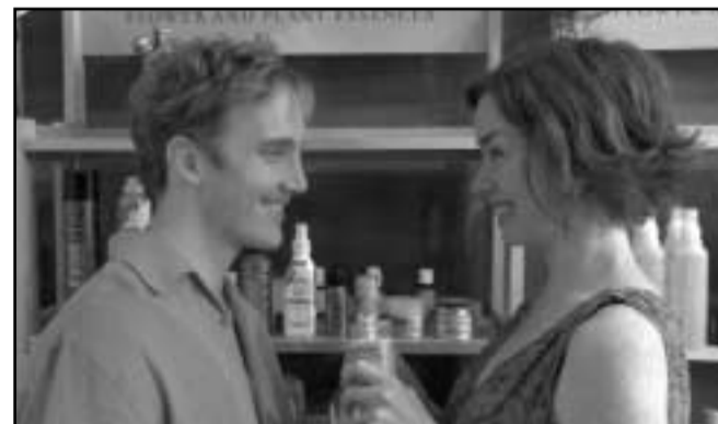
SEEING OTHER PEOPLE – Starts July 30th