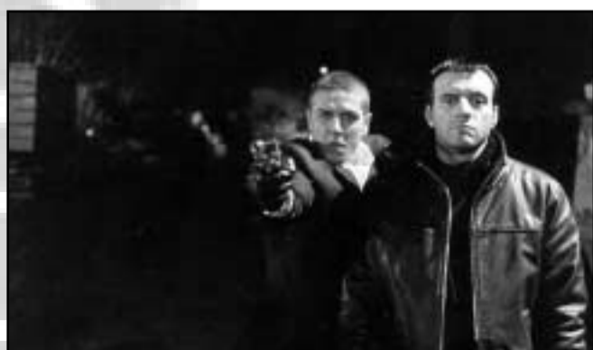
LA MENTALE: THE CODE – Starts July 16th

The original summer blockbuster is back – August 27th