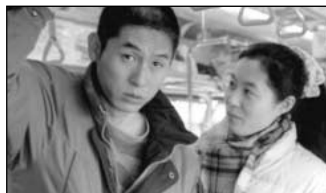
OASIS – Starts August 20th