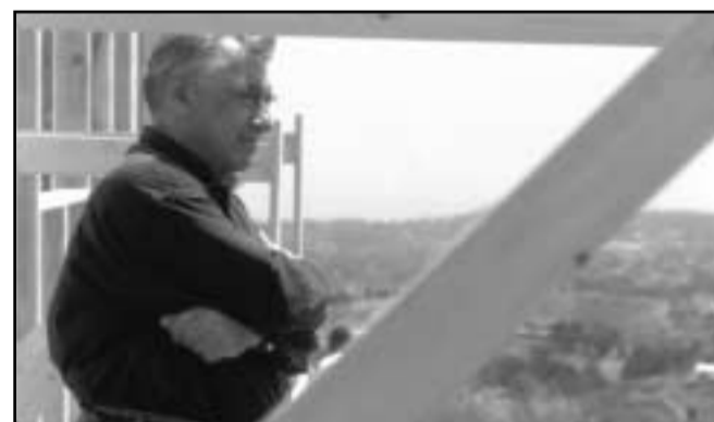
A HOUSE ON A HILL – Starts August 13th