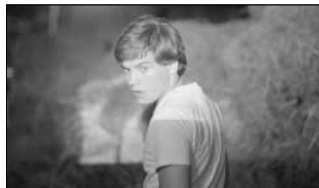
THE MUDGE BOY – Starts August 6th