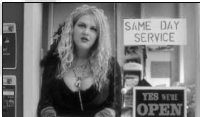
GYPSY 83 – Starts June 25th