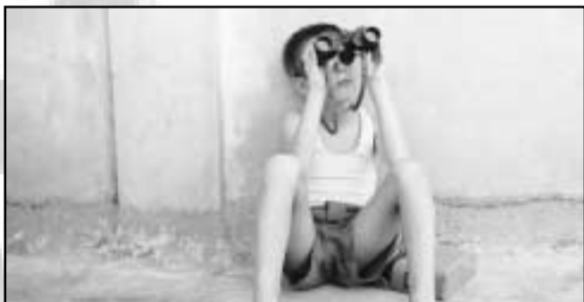
HARD GOODBYES: MY FATHER - Starts November 26th