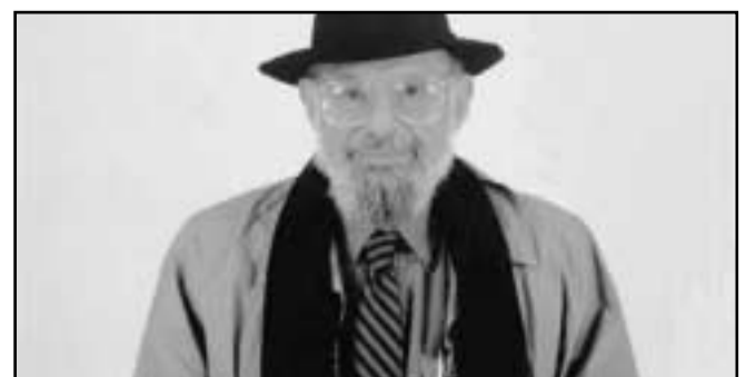
LIFE & TIMES OF ALLEN GINSBERG - Starts January 21st