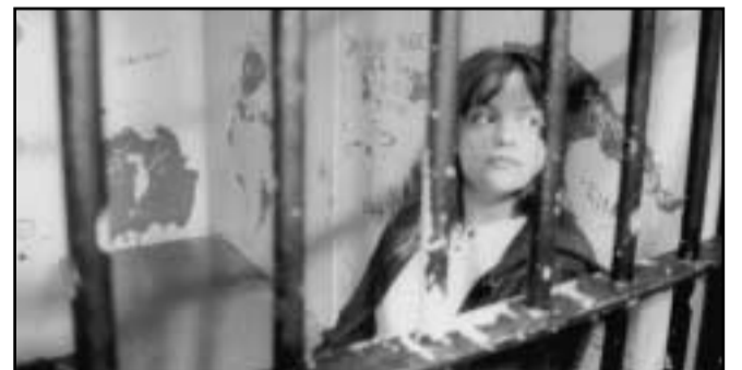
VIRGIN - Starts January 14th