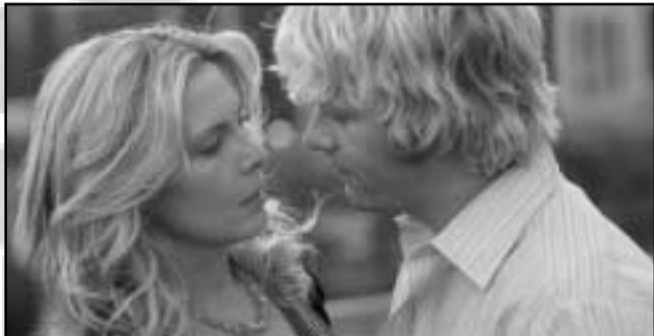
STANDER - Starts November 19th