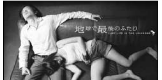
LAST LIFE IN THE UNIVERSE - Starts December 17th