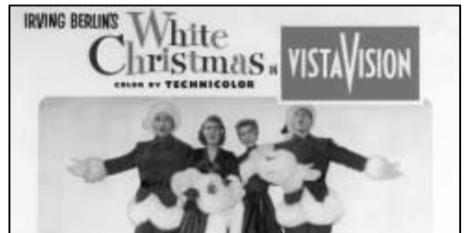
WHITE CHRISTMAS - Starts December 24th