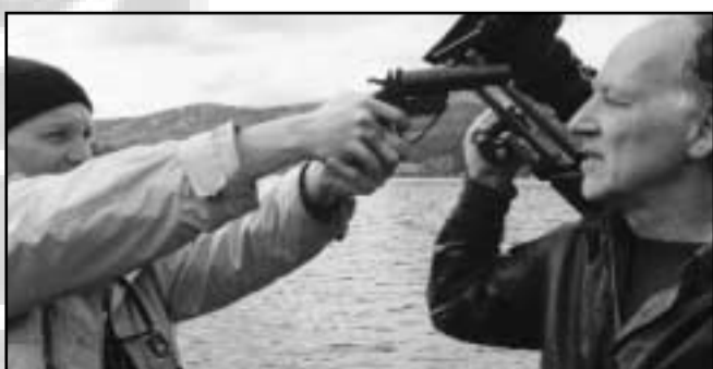
INCIDENT AT LOCH NESS - Starts December 10th