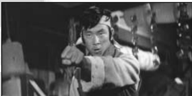
GRINDHOUSE FILM FESTIVAL - November 19th - 21st