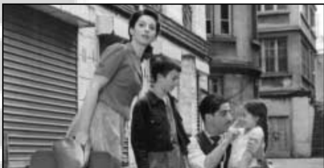
ALMOST PEACEFUL - Starts December 3rd