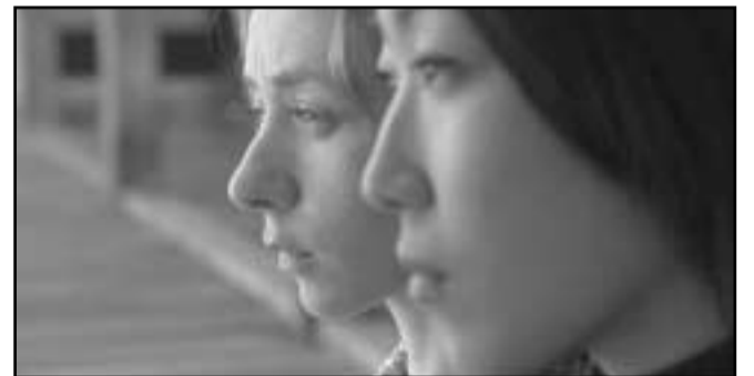
FEAR AND TREMBLING - Starts January 7th